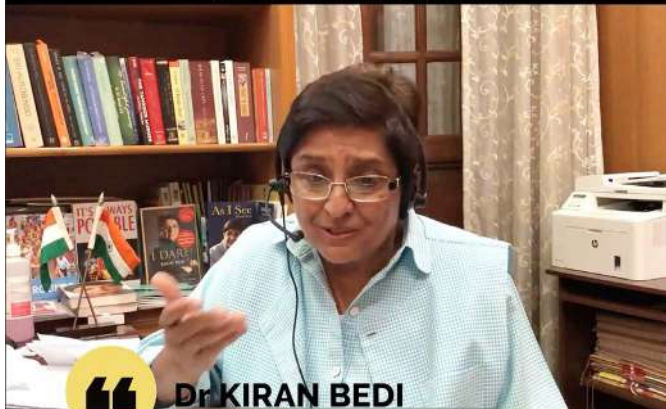
Dr KIRAN BEDI